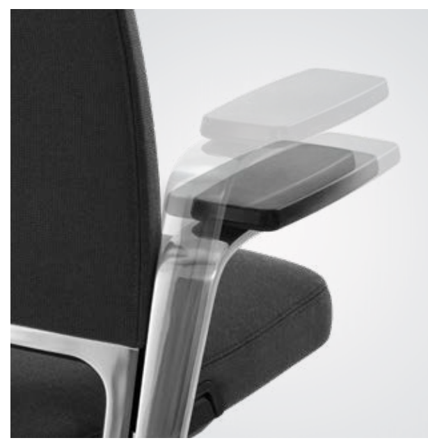
3D T-armrest: Height, width and depth adjustable, soft pad

Auto Flow armrest: Height and width adjustable, encourages movement, with extra soft pad