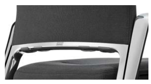
Backrest upholstery with lumbar support: The integrated lumbar support can be adjusted in height and depth with two levers at the bottom of the backrest to suit individual requirements.