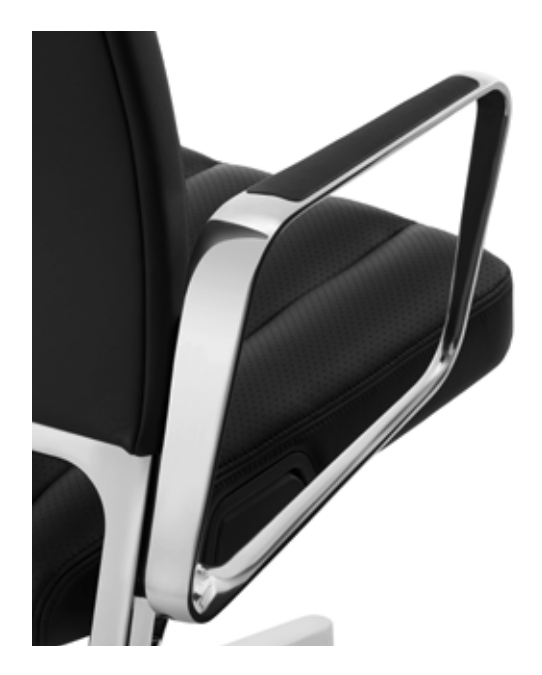
Ring armrest: Designer armrest with or without leather cover